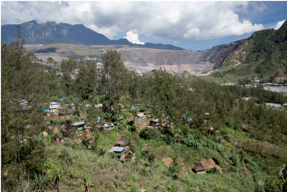
FIGURE 1. – The mining pit at Porgera and the settlement where the meeting with the Mamai Kenja described p. 46 was held. Sixteen years after the mine went into operation, the settlement had unimproved sanitation and no water supply