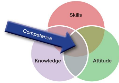
Figure 3: The skills-knowledge-attitude model for competence (Appleton 2016:2)

All existing management committees of current protected areas were invited to workshops about the management effectiveness of their protected areas in 2016-17. People indicated their support for the protected areas, the level of support they receive, and their priorities for capacity building.