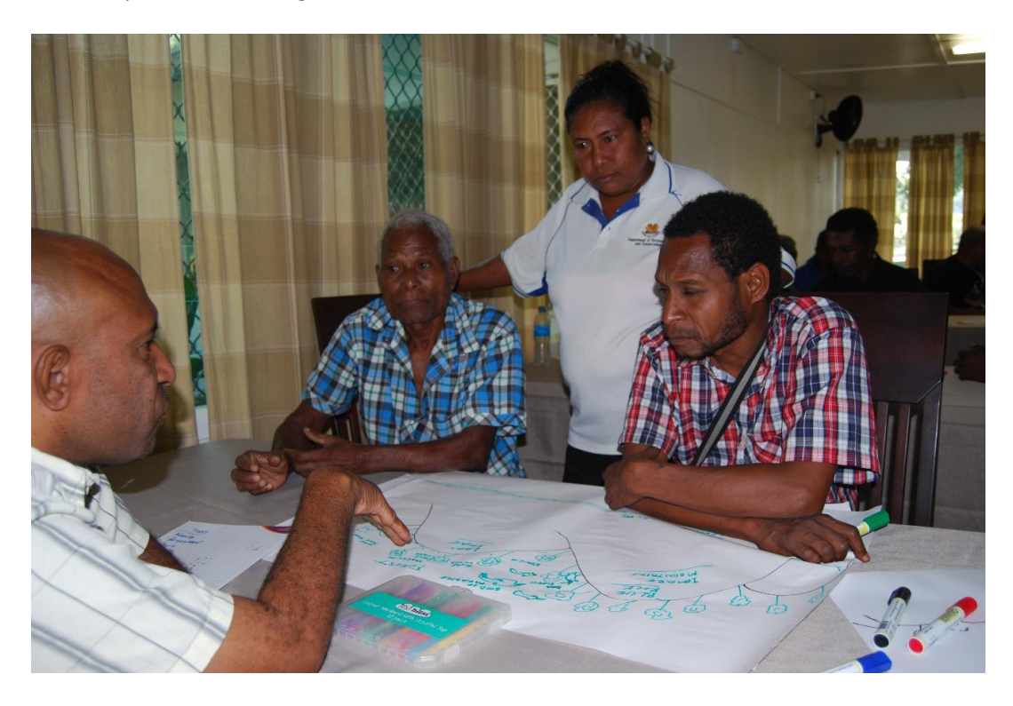
Management committee members met to discuss management effectiveness in 2016-17. This was an important reengagement with communities, many of whom asked for support and advice from CEPA, especially with alternative livelihood options. Follow-up help is now needed.

However, most committees need to be either reformed or re-invigorated, and almost all need better capacity and resourcing. In addition, new committees will be formed as the protected area network expands. To re-invigorate these committees and to build their capacity is a huge commitment across PNG, and the challenges of working in the remote, inaccessible areas is recognized. The undertaking must be through a cooperative partnership of CEPA, provincial and local level government, the larger non-government organisations, local CBOs, industry and donors. For this reason, forming partnerships and developing a roadmap for re-engagement will be a high priority activity. CEPA is committed to supporting the management committees as much as possible, in recognition of their critical role.