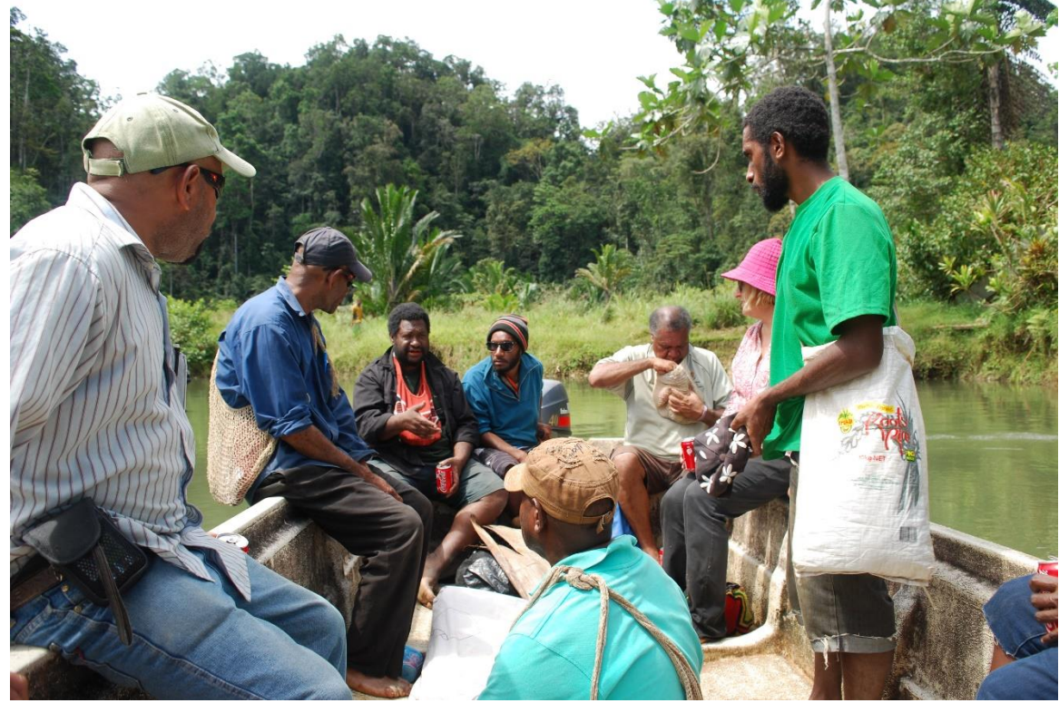
Through meeting landowners in their protected areas, CEPA gains a real understanding of their management issues and capacity and discussions are on an equal footing.

support role that CEPA will play. These guidelines should not be overly prescriptive and should not delay the start of the process. Lessons learned during the re-engagement process should be fully documented.