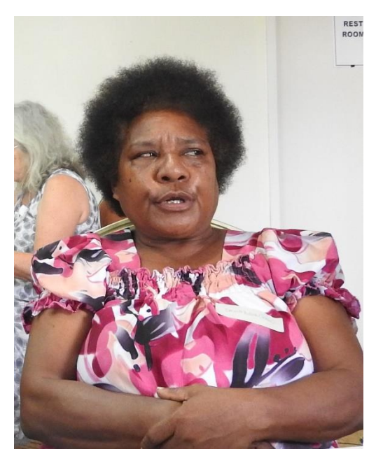
Women are poorly represented in many PNG management committees, but their equal presence is an important principle for future work.

Ownership: Community Engagement Models which add value and promote peoples' sense of origin, sense of identity and sense of belonging to a sustainable and self-reliant life style.