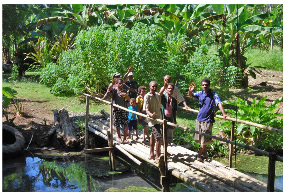
Landholders of Balk Wildlife Sanctuary, where the management committee works hard and where all of the community is rostered to help with maintenance on a regular basis. Here tourism and craft sales have the potential to help fund the protected area.

Management committees are the critical 'feet on the ground' for PNG's protected areas: without their continuing work and commitment, there will be no more effective protected area management in the future. CEPA is committed to continuing support for these committees, and will endeavor to help their work become more effective and rewarding in the future. Through well resourced and effective management committees, an effectively managed protected area network is achievable.