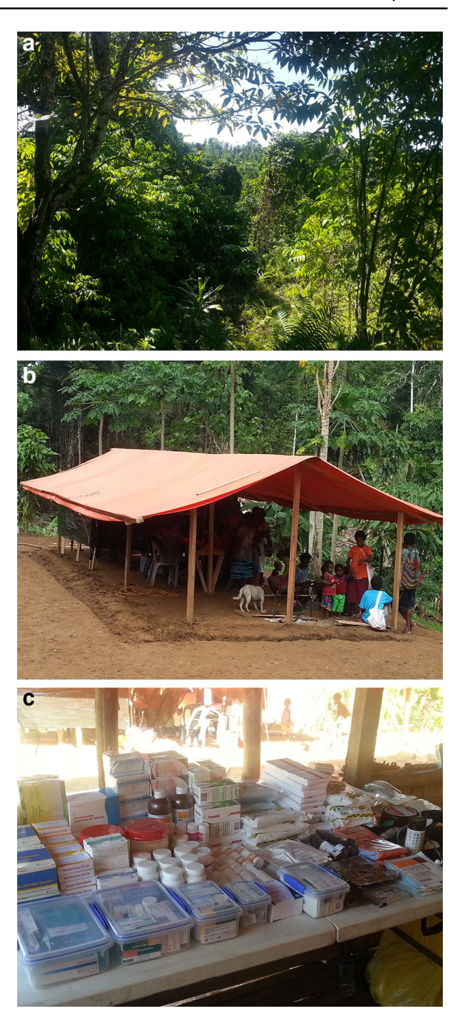
Fig. 1 Wanang Conservation Area health needs assessment. a tropical rainforest around Wanang village; b research and treatment shelter with spaces for private clinical examinations and a waiting 'room' with an admin desk and cooking fire. In the evening the shelter hosted community discussions on health service priorities; c medicines stock for the treatment of urgent cases

97% of PNG is owned or claimed by clans as communal property, offering a potential counterweight against destructive pressures emanating from global commodity demands (Laurance et al. 2012). However, lacking alternative development options many clans take inducements from extractive industries (Novotny 2010). The United Nations vision of sustainable development (itself a development model authored far from PNGs forest communities) requires protecting life on land (SDG 15) and supporting good health (SDG 3) (UN 2018). Yet these goals may seem in conflict to some remote clans in PNG with low levels of health provision. Logging companies' offer of roads and income can decrease remoteness from health