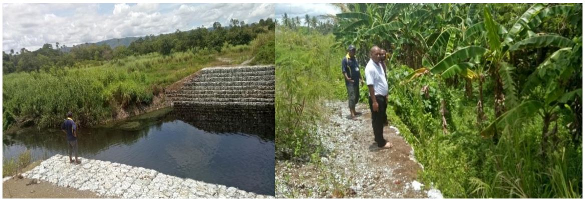
Photo 1& 2 Erosion is well protected by gabion baskets and re-vegetation on all bridge sites

25. The soil erosion from sites and its sedimentation in rivers reported in the previous EMR are protected by vegetation growth. Re-vegetation of slopes and cut surfaces has been undertaken and the growth of grass cover is highly favourable to design expectations. There is no more soil erosion as vegetation grow back stabilized the embankments.