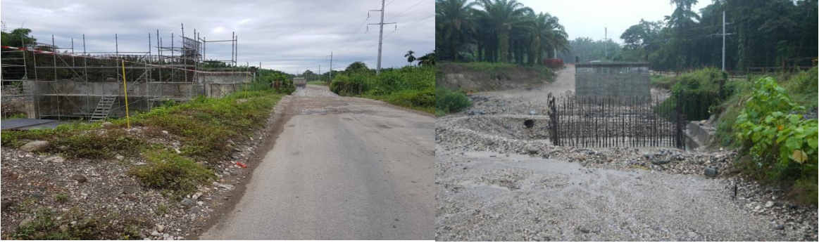
Photo 7 & 8: A Site Remains Closed and Secured during Work Suspension