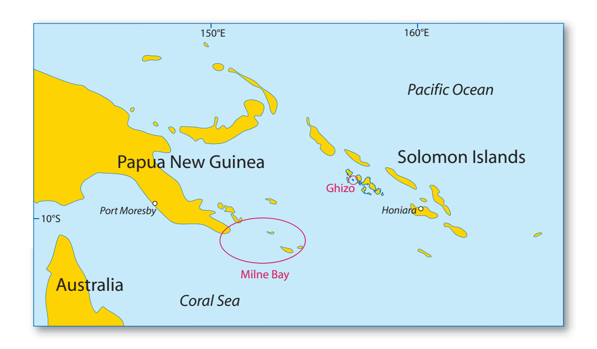
Figure 1. Papua New Guinea and Solomon Islands showing Ghizo Island and Milne Bay Province

Typical of urban centres described by Adams et al. (1996), Ghizo's population is gradually increasing through rapid immigration by people looking for employment. This has meant that the percentage of income generated from informal economic activities such as fishing is inevitably increasing (Otter 2002). Gizo town has by far the biggest fish and food market in Western Province. The local economy revolves around services and tourism, but the food market, which is open 24 hours every day, attracts people from all around the area, including fishers and agricultural produce sellers from other provinces such as