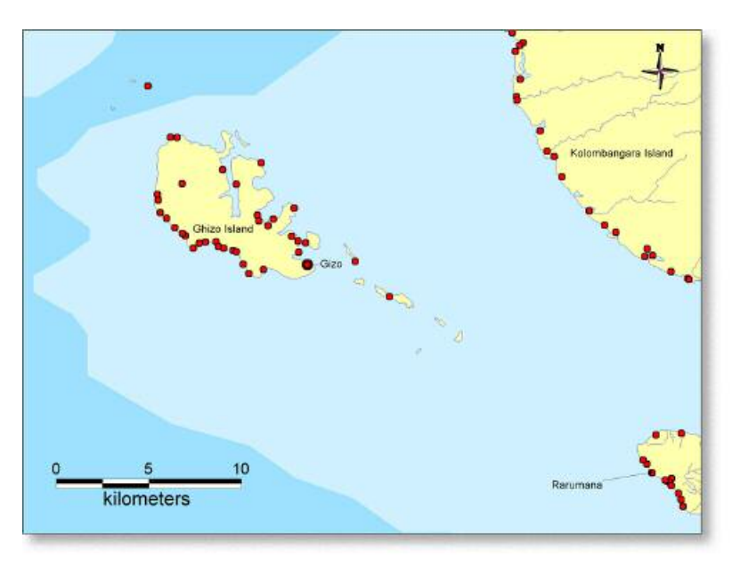
Figure 2. Ghizo Island showing Gizo town and proximity to the large island of Kolombangara and the large village of Rarumana on Kohingo Island.

The first two questions deal with ecological knowledge and most effective fishing methods. Detailed knowledge of parrotfish behaviour was observed.