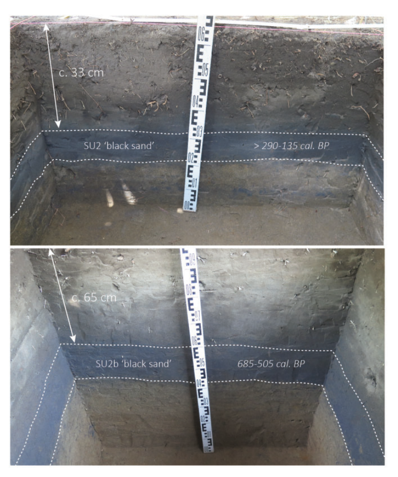
Figure 5. Buried black sand (Munsell = GLEY1 2.5N) in the Koavaipi, Square A (top) and Miruka I, Square A (bottom) excavations. It should be noted that the depth of these deposits varies greatly across Popo and beyond (see also PNG Mineral Resource Authority, 2016).

In the Koavaipi excavation (Koavaipi 1, Square A), the layer of black sand was recorded as the second Stratigraphic Unit below the surface (SU2) (Figure 5). SU2 is 10 cm thick on average and commences c. 33 cm below the surface. Carbon dates acquired from the stratum above (SU1) suggest that SU2 accumulated immediately before the period 290–135 cal. BP. According to the tenets of archaeology, SU2 is