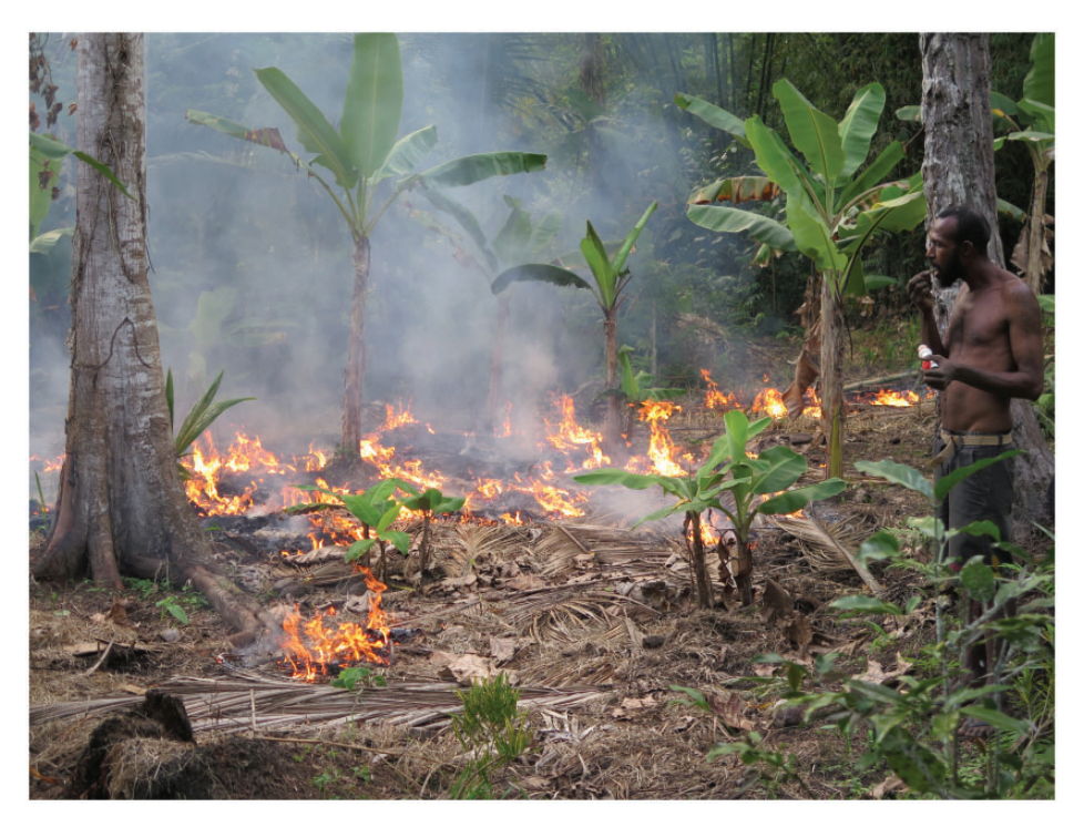
Figure 3. Amix Hulape (Pakemara clan, Kaivakovu village) looks on while burning off his garden plot at the tribal estate of Koavaipi (compare with Williams, 1940: Plate 3). Foliage from previous gardens and undergrowth has been cut down and allowed to dry before the burn. As Williams (1940: 101) noted in the 1920s–1930s, some large trees are retained.

ongoing connections with these places, a process as much political as subsistenceoriented.