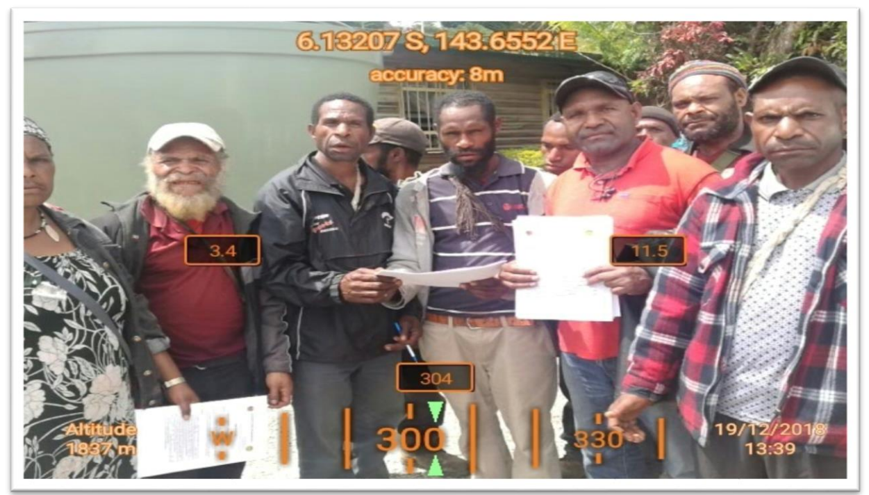
Image 4:Leaders representing the Affected Persons (APs) within the 500meters road section after signing four (4) separate deeds of release confirming the acceptance of Kina 20,000.00 in Package as part of Compensation Payment for loss of Environmental Damages within a 500meters road section.