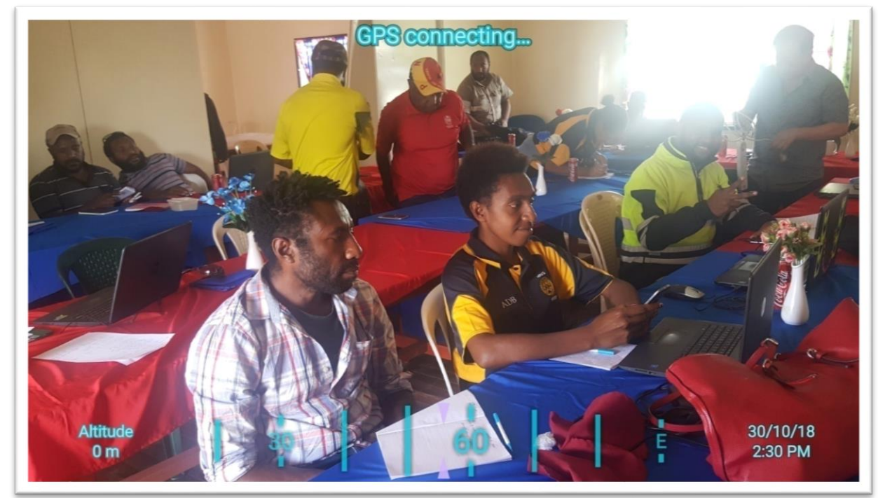
Image 7:HRMG Social and Environmental Safeguards Officers during one of the Seminar workshop on ADB's Reporting format that was held at Kuri Lodge-Mt.Hagen,WHP.The seminar workshop was facilitated by both International Environmental and Social/Resettlement Safeguards Specialist. Participants were trained on how to write a report as per ADB's reporting format and required standards.

Image 6:Nengia Ceremonial Ground at Km 17.950 is one of the four (4) Ceremonial Areas that will be affected during the course of civil works. The road will traverse this ceremonial ground based on the scope of work. Clans owning the area have agreed to receive in-kind assistance as part of compensation payment and pave way for the road to traverse the ceremonial area. The above diagram illustrate where the road will traverse and scatter the ceremonial area.