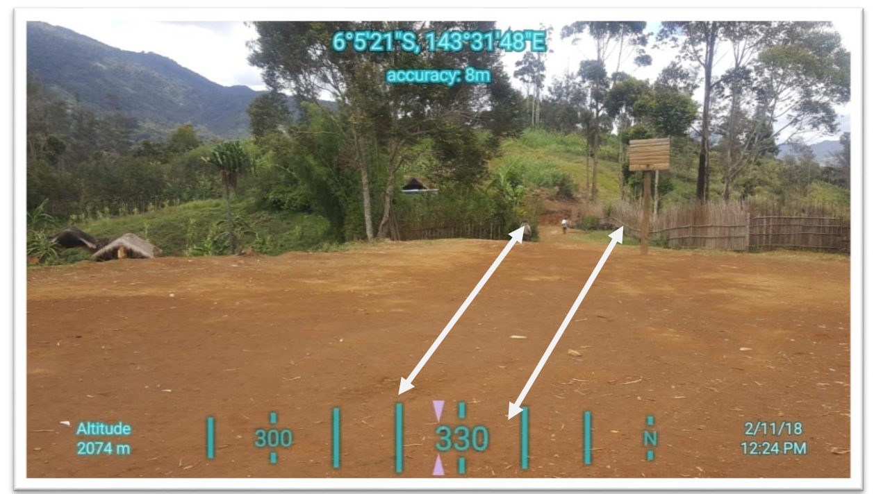
Image 6:Nengia Ceremonial Ground at Km 17.950 is one of the four (4) Ceremonial Areas that will be affected during the course of civil works. The road will traverse this ceremonial ground based on the scope of work. Clans owning the area have agreed to receive in-kind assistance as part of compensation payment and pave way for the road to traverse the ceremonial area. The above diagram illustrate where the road will traverse and scatter the ceremonial area.