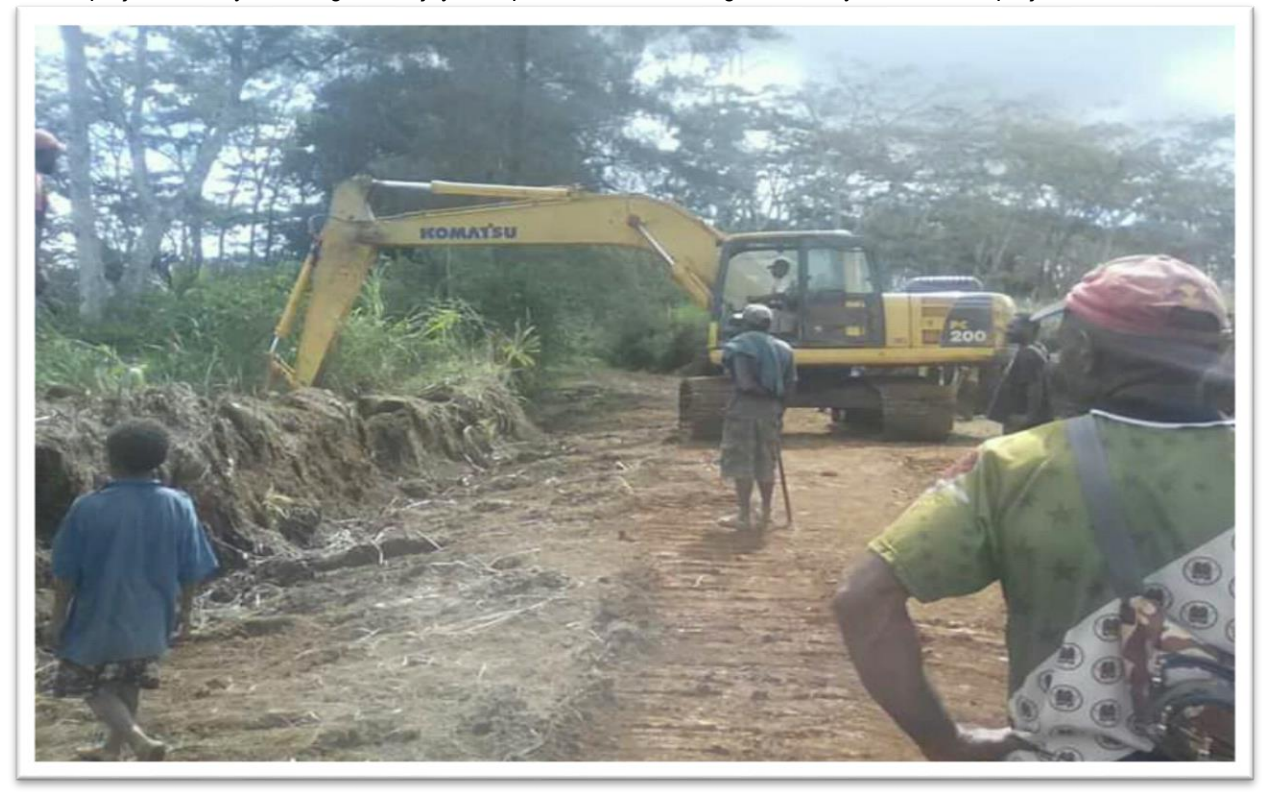
Image 7: Image 4: Civil Works (Clearing and Grubbing) resumed yesterday ( Tuesday, December 11, 2018 ) at Pubi-Paiyama area after the consensus reached between locals and HRMG during the discussion held on Monday, December 10, 2018.Locals have now agreed to allow the work to proceed.