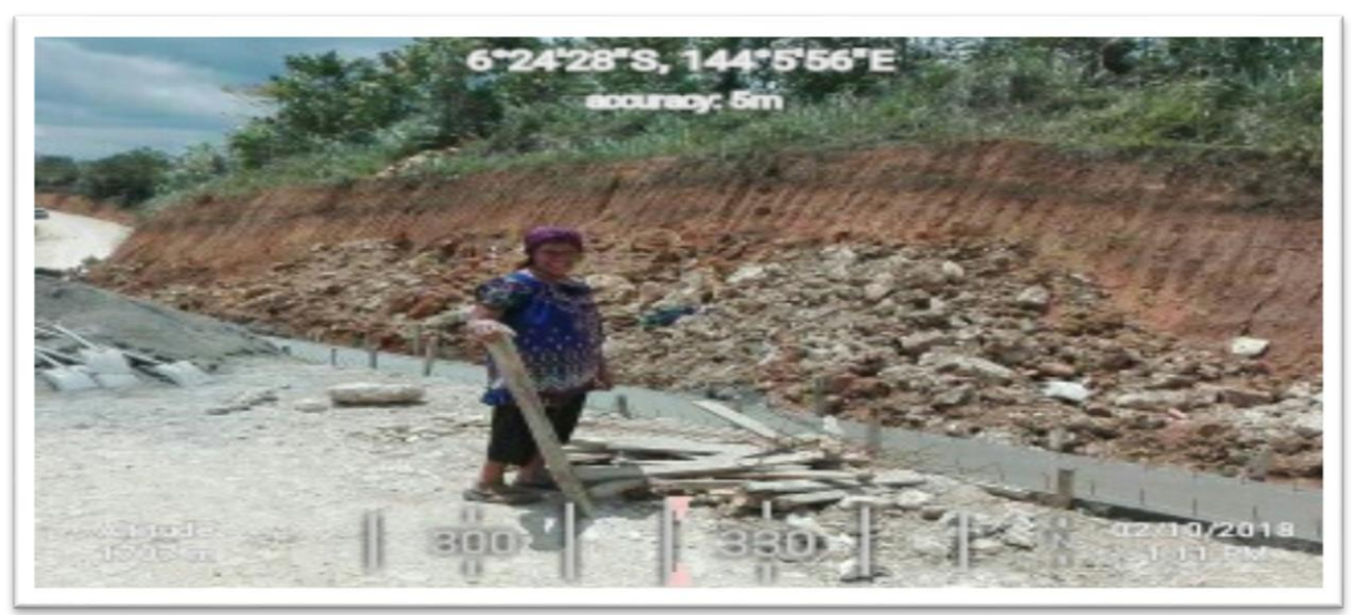
Image 3: Woman's participation in non-payroll activities. Seen in this image here is a female engaged in line drain works.

102. For the covered period, there were 726 unskilled locals along the affected communities employed by contractor to work in non-payroll various construction activities. The wages paid to them depends upon the completion of a certain given tasks. Hence it was not commutated using the estimated wage rate of Kina 500.00.Such assigned tasks are on a casual basis and both male and female were engaged to carry out the tasks.