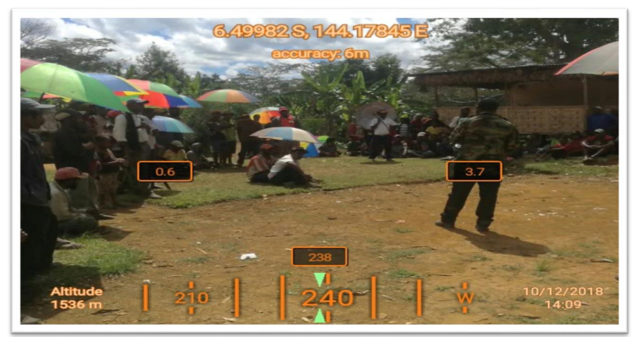
Image 2:HRMG Resettlement Safeguards Officer providing a feedback to locals in response to concern raised by ward leader regarding missed-out payment for Improvements within Pubi Village.

81. During the consultations, all DPs have been informed about the GRM and the method of accessing the process through consultations such as meetings, focus group discussions and through word of mouth by community leaders who have been thoroughly briefed about the GRM process. DPs were also informed that they are allowed to resolve their grievances through the formal court system should they be unhappy about the solutions proposed by the GRC.