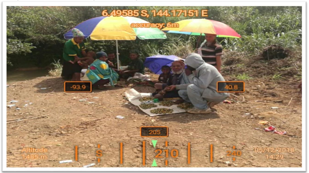
the road project as they now begin to enjoy the spin off benefits brought about by the road subproject.

Image 6: Roadisde vendors selling betel nuts along the road subproject. Vendors have expressed contentment over