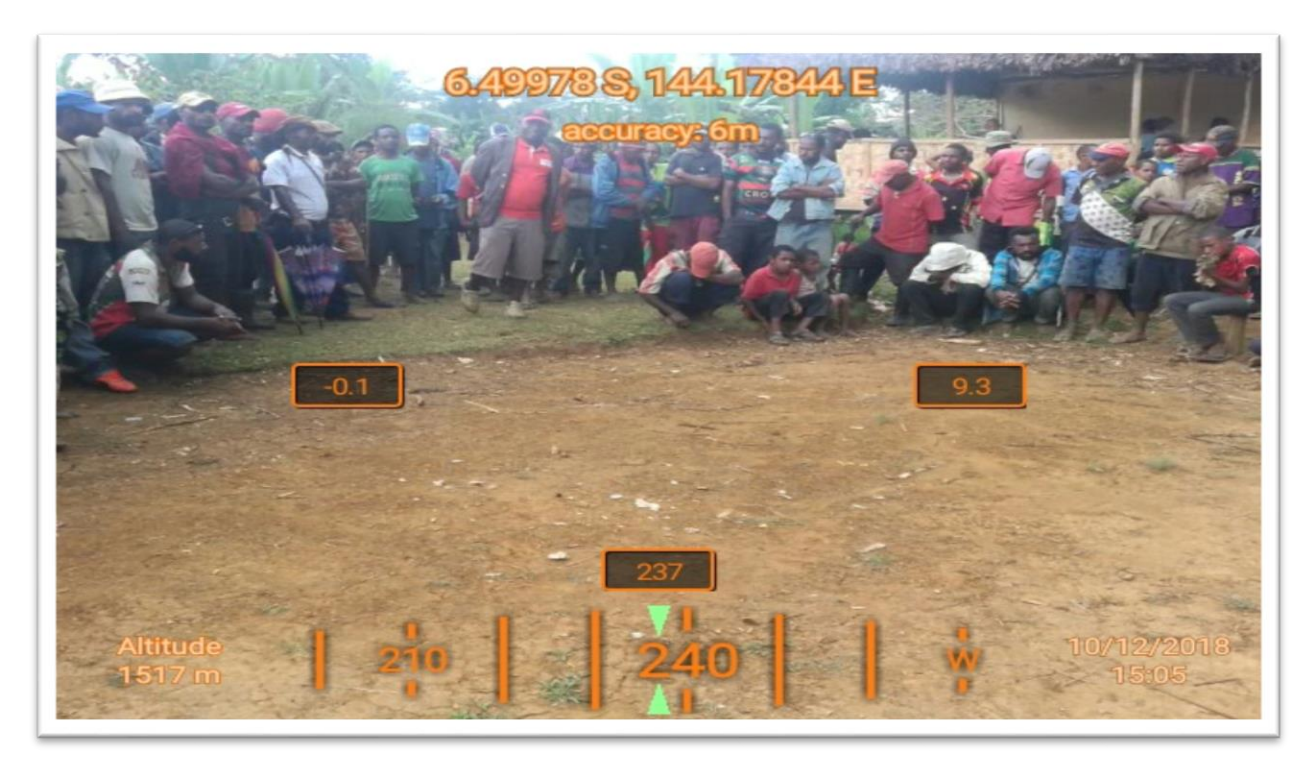
Image 1: Ward Leader of Pubi-Paiyama LLG Ward Mr.Max Tiripi expressed concern regarding the Ceremonial Area with the Surrounding Village that will be affected when the road traverse the area.

78. An important consultations were held with the affected communities at Pubi Village in Paiyama Council ward located at chainage 28.680.It is located in South Wiru LLG in the Ialibu-Pangia District. The discussion was held between HRMG officials and the affected communities of Pubi Village. The affected communities have strongly demanded ADB-HRMG to relocate the village to pave way for the road project.