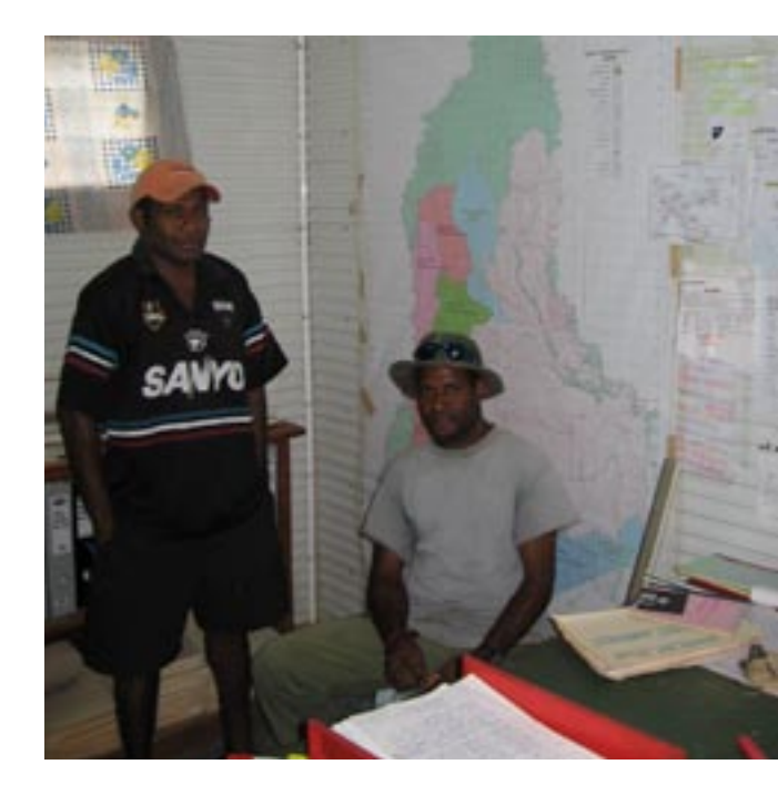
The future of the forests depends upon dedicated foresters

The different reviews set out a whole range of general governance and project specific recommendations. These range from a proposal to divide the PNG Forest Authority into two separate organizations and the implementation of a Commission of Inquiry with powers to summon documents and cross-examine witnesses, through to remedial actions to correct procedural errors in the development process for individual projects. The majority of these recommendations do not appear to have been acted upon.