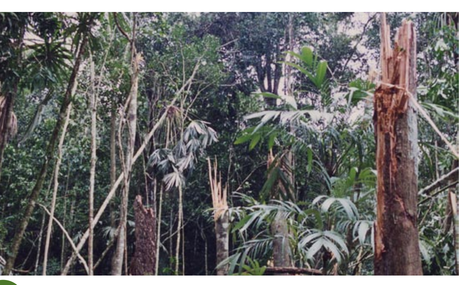
Felling damage can cause severe damage to residual trees

The picture was clearly seen as unpromising, but not uniformly so. Two exceptional projects, at Open Bay (TP15-53) and Watut West (TP13-33), were singled out for praise. They are differentiated by their long-standing nature (having been in operation for over 40 years); the commitment of the operators to a single project rather than acquiring more concessions; partial State ownership; mostly local workers and a focus on training and localisation; and a long-term commitment to establishing plantation areas to ensure continuity of supply.