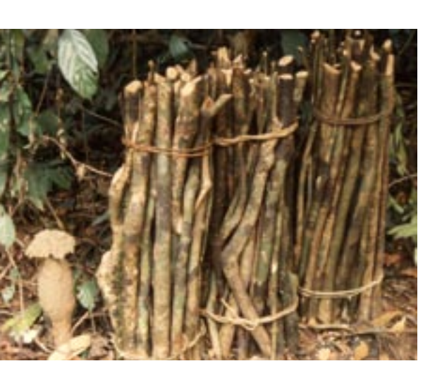
Fuelwood remains an important energy source for rural people