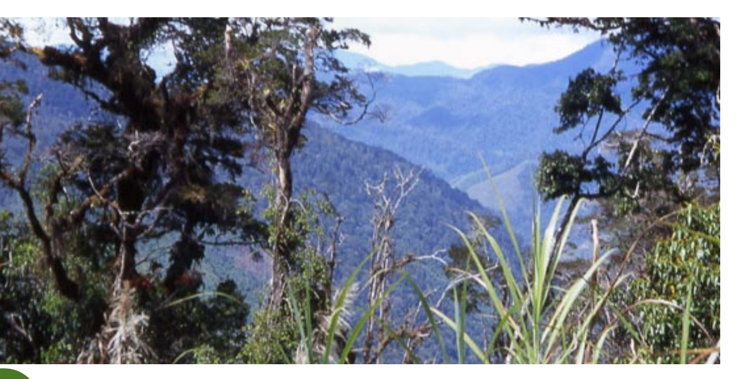
Forests of Papua New Guinea

There have been several comprehensive research studies of the forestry sector (e.g. Filer, 1997; Filer with Sekhran, 1998; and Hunt, 2002), all of which have documented the considerable tensions within the country as a local definition of sustainable forest management has been sought. This paper, in a small way, continues this exploration, by describing the historical development of some elements of the PNG forestry sector. It does not attempt to provide a comprehensive overview, but aims to establish some of the facts relating to several key areas that have influenced the direction of forestry development. It is based largely on a review of the literature.