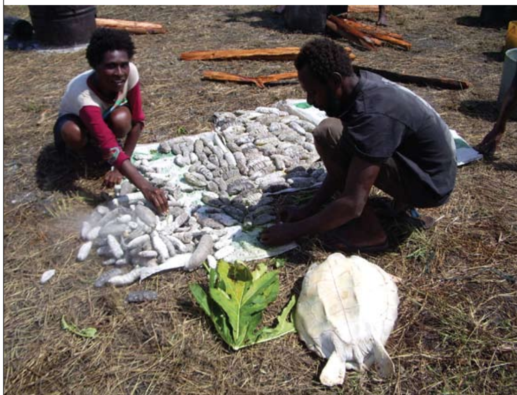
FIGURE 3 Juvenile green turtle ( Chelonia mydas ) caught as bycatch in the sea cucumber fishery in Papua New Guinea Western Province