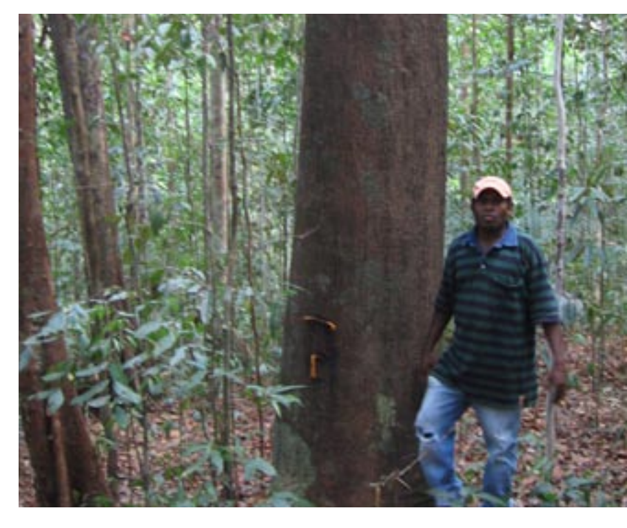
Raising landowner awareness can lead to better management of forest resources

While the PNGFA conducts some level of landowner awareness-raising prior to the incorporation of ILGs and the acquisition of timber rights, the 1991 Forestry Act makes no specific provision for this. Nor have procedures for awareness-raising been developed to assist NFS officers. This makes it difficult to verify whether all affected landowners have given their Free and Prior Informed Consent (FPIC), based on a proper understanding of the potential implications of ILG incorporation and logging. Under circumstances where NFS officers may be required to complete awareness-raising in as little as 3 weeks, over an area as large as 100,000ha<sup>14</sup> and with remote communities, establishing clear standards of performance for (and means of verifying) FPIC remains a significant gap.