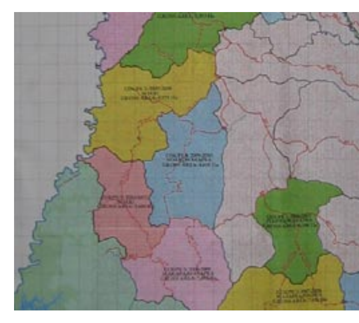
Many ILGs occur within major forestry projects

The main purpose of the Land Groups Incorporation Act (1974) was to provide the legal vehicle for the holding of registered group titles, and not a means of identifying and adjudicating who the true owners of the land are. The 1973 Commission of Enquiry into Land Matters envisaged that the registration of customary land would be addressed under separate legislation. It also enabled landowners to cash crop their own land (Whimp, 1998).