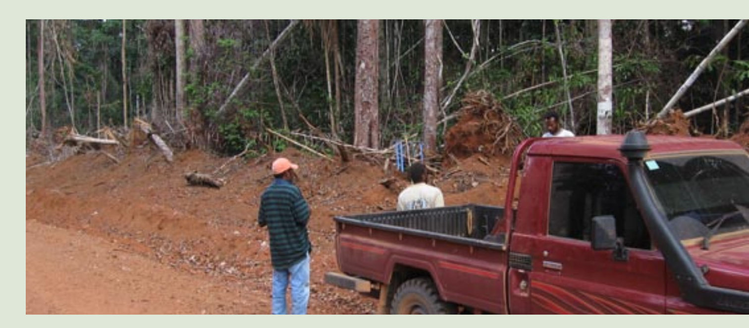
Gaining public oversight of forestry is needed but difficult

In addition to standing commissions on Anti-Corruption and Human Rights, it has been proposed by the PNG Eco Forestry Forum that another standalone Commission of Inquiry into the forestry sector be instituted. This would present an opportunity to comprehensively review and overhaul the functioning of the forestry administration.