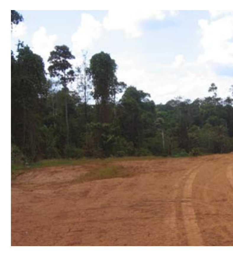
Cleared log road

The contentions set out in SCM No. 3 of 2006 reflect the findings of the Ombudsman Commission (2002)<sup>10</sup> and the Independent Review of Proposed New Forestry Projects,<sup>11</sup> that the Kamula Doso FMA, as signed by the landowners, was invalidly executed and certified and that these failures needed to be rectified. Amongst others, the Ombudsman concluded that any future allocation of Kamula Doso "must comply with the provisions of the Forestry Act as amended in 2000" – including the requirement that it be allocated by competitive selection.