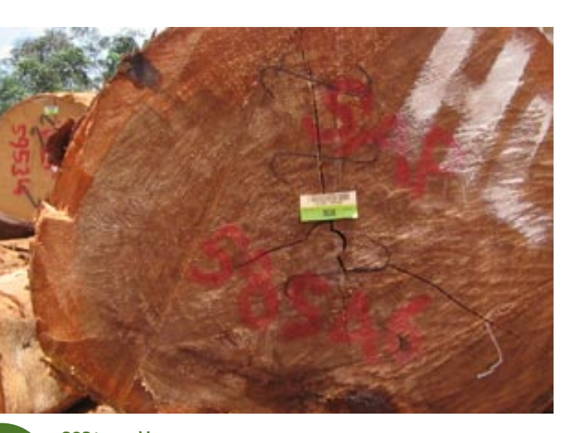
SGS tagged logs

Some provincial and local-level administrations are working proactively to put in place policies and need as much support as they can get