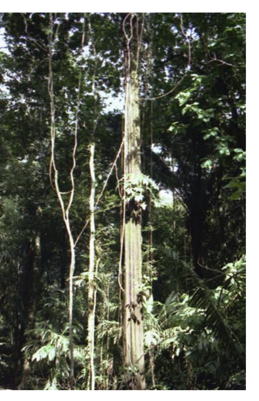
Many tree species are found within the rainforest