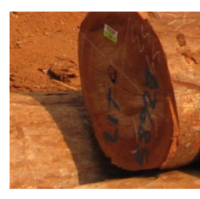
Log export monitoring has been assisted by SGS log tracking

A consolidated court would also help to address the disarray facing mechanisms for resolving land disputes. Under the Land Dispute Settlements Act 1975, land disputes between customary owners are in the first instance resolved through the appointment of a second-level magistrate as a mediator to settle the dispute on the basis of custom, and to walk agreed boundaries. If that fails a dispute may be referred for hearing by a lower-level court magistrate and, above that, by a Provincial Land Court (in practice the District Court). Appeals may also be made to the National Court. Other categories of dispute, including those involving State land, are resolved through a separate process under the National Land Titles Commission and the National Lands Commission. The system is, however, relatively complex to administer. Lower-level level magistrates often lack the resources (and indeed the will) to fulfil their basic mediation function. District and National Courts are overstretched and difficult to access for all the reasons highlighted above, and also lack a specialist jurisdiction in land.