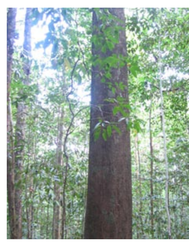
Governing the forest sector needs realism

Changes to the legal and institutional framework governing the forest sector will need to be prioritised and phased, in line with available public finances and the institutional capacity to see them through. The challenge is to identify realistic but strategic entry points - a Board Secretariat might be one such option, a forest-sector Warden another.