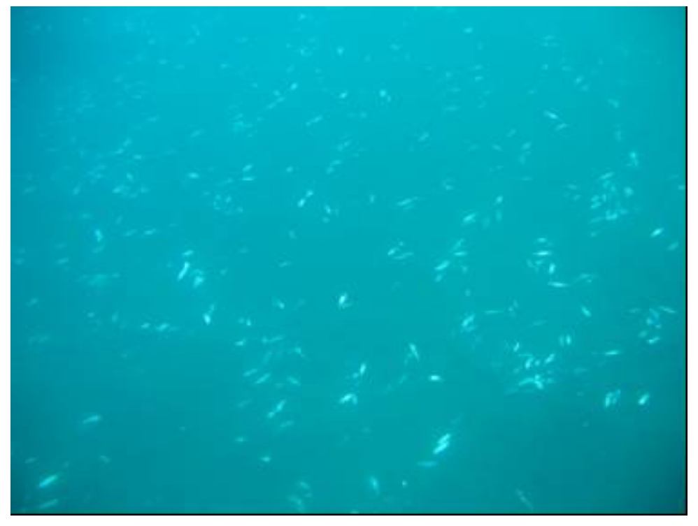
Figure 8: A bird's eye view of just some of the thousands of dead fish that covered the seabed, most of which were well outside of free divers range.