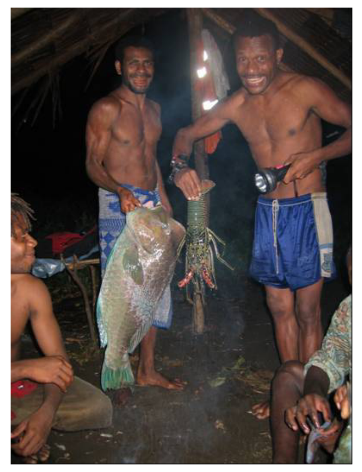
Figure 2: Nighttime spear-fishers from eastern Kimbe Bay displaying part of their catch.