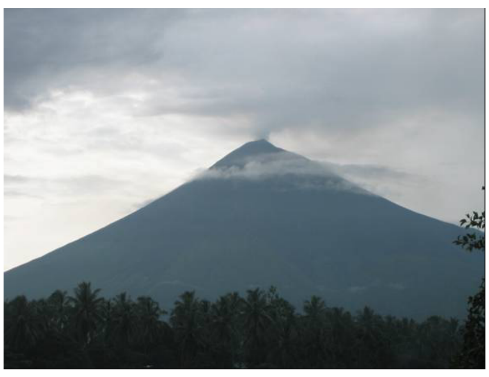
Figure 1: Mt Uluwan smoking away in the distance. This photo was taken from the TNC field station at Ulamona.

Kimbe Bay is a large bay (140 km x 70 km) that is located on the north coast of the island of West New Britain. The landscape is dominated by numerous volcanoes that reach heights of over 2000 m (Figure 1). Kimbe Bay is one of the world's most diverse and significant tropical marine environments, with the bay comprising a wide variety of shallow and deepwater marine habitats that are in very close proximity to each other. Rapid Ecological Assessments have described healthy coral reefs with high biodiversity, especially in the eastern and mid- to outer-portions of the bay. These reefs are considered part of the global centre of marine biodiversity known as the "Coral Triangle" (Green and Lokani, 2004).