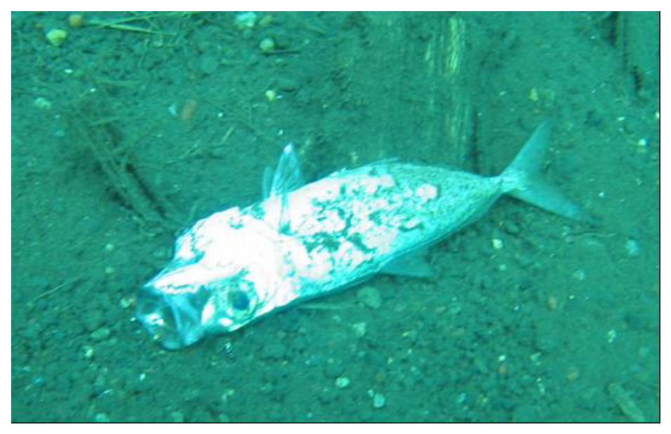
Figure 7: Poisoned fish on the sea floor.