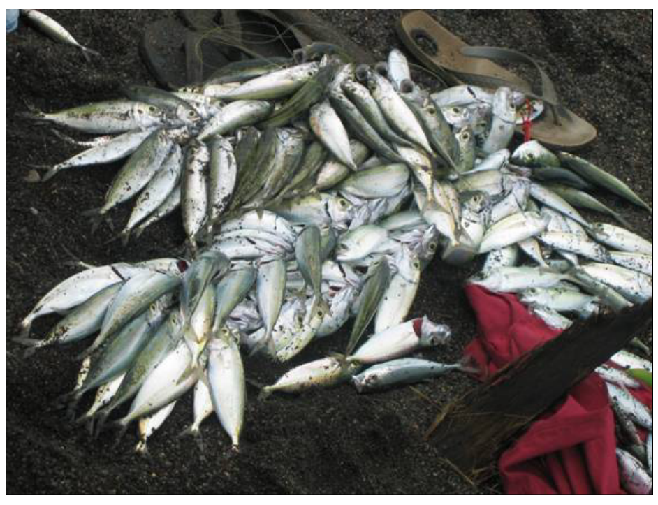
Figure 6: An individual's catch.