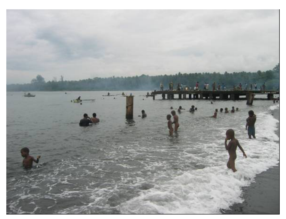
Figure 5: Fishers collecting poisoned fish. The poison was dumped by fishers seen in the canoes in the background.

On March 9, 2005, we by chance observed fishers from Ulamona poisoning a large school of sardines. We were unable to identify or quantify the type of poison used, but insecticide was suspected given the very large area over which fish died, and the fact that fishers were generally not willing to talk to us about what poison had been used to kill the fish. Fish were poisoned in a black sandy bay and we arrived after the poison had been dumped in the water and when fishers were collecting dying and dead fish (Figure 5 and 6). Fishers that had goggles or masks were free diving, but the majority were simply using their hands to collect stunned and dying fish that were near the surface. Fish lay scattered over the seabed from 1-40 meters depths over hundreds of linear meters (Figure 7 and 8). It was obvious that the vast majority of fish that had died were in water too deep for free divers to access.