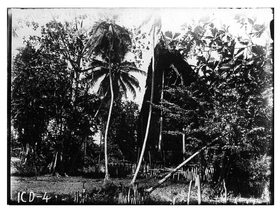
FIGURE 1. "Aikava Ravi (Iari)."