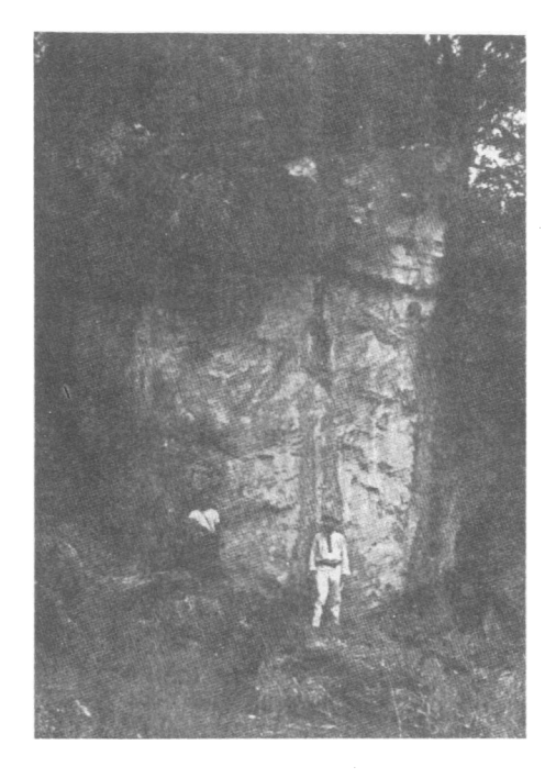
FIG. 1.—LIMESTONE BLOCK WITH PAINTINGS.