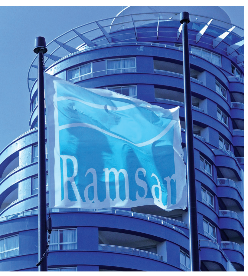
The mission of the Ramsar Convention is the conservation and wise use of all wetlands, as a contribution towards achieving sustainable development throughout the world.

The Convention on Wetlands is an intergovernmental treaty adopted on 2 February 1971 in the Iranian city of Ramsar, on the southern shore of the Caspian Sea. Thus, though the name of the Convention is written "Convention on Wetlands (Ramsar, Iran, 1971)", it has come to be known popularly as the "Ramsar Convention". Ramsar is the first of the modern multilateral environmental agreements on the conservation and sustainable use of natural resources, and compared with more recent ones, its provisions are relatively straightforward. It is unusual in establishing commitments at site level as well as at the level of national policy. Over the years, the Conference of the Contracting