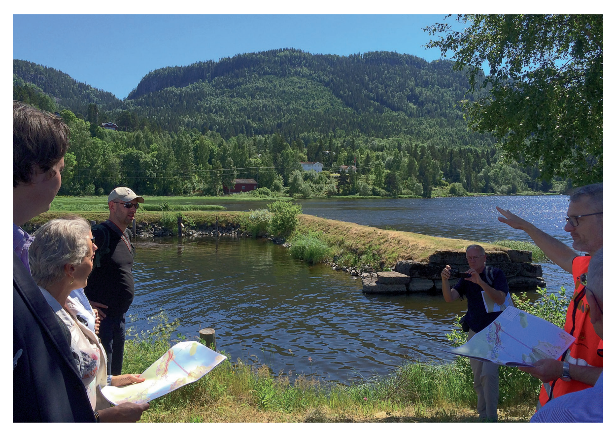
A Ramsar Advisory Mission in July 2015 to the Nordre Tyrifjord Wetlands System Ramsar Site in Norway.

In addition, in accordance with Article 8.2 of the Convention, the Ramsar Secretariat has the responsibility to inform the other Contracting Parties of "any alterations to the List or changes in character of wetlands included therein", and to arrange for these matters to be discussed at the next meeting of the Conference of the Parties. All substantive Article 3.2 reports and responses to them are therefore communicated by the Secretary General to the COP, which may wish to offer its own advice in the form of a COP Resolution or Recommendation.