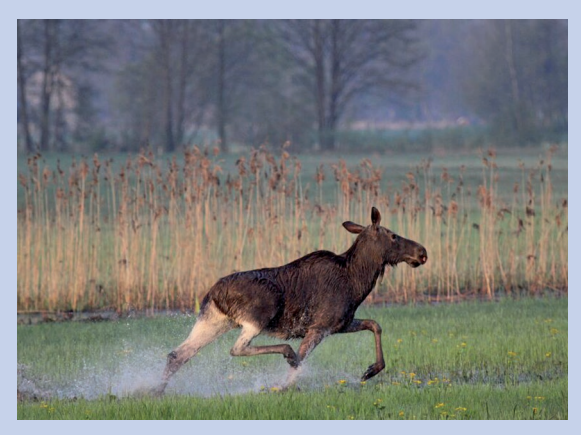
Young moose in the Biebrzanski National Park and Ramsar Site in Poland

Criterion 9: A wetland should be considered internationally important if it regularly supports 1% of the individuals in a population of one species or subspecies of wetland-dependent non-avian animal species.