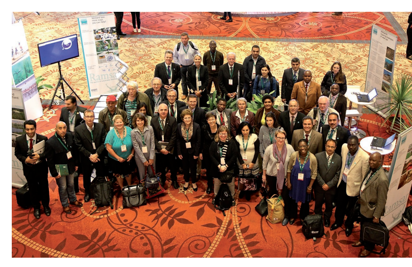
The Standing Committee oversees Convention affairs and the activities of the Secretariat, on behalf of the Conference of the Contracting Parties (the COP), between its three-yearly meetings.

The Standing Committee normally meets once each year, traditionally at the offices of the Secretariat in