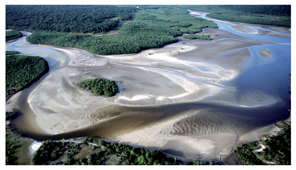
Archipel Bolama-Bijagos Ramsar Site in Guinea-Bissau. The Convention established six geographical regions: Africa, Asia, Europe, Latin America and the Caribbean, North America, and Oceania.

Committee based upon nominations from the Administrative Authorities of Contracting Parties, but they serve in their own capacities as experts in the scientific and technical areas covered by the STRP's Work Plan and not as representatives of their countries or governments. Resolution XII.5 (2015) approved a new framework for delivery of scientific and technical advice and guidance under the Convention, replacing the earlier modus operandi established under Resolution XI.18 (2012).