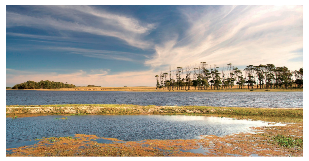
Laguna de Rocha Ramsar Site in Uruguay, part of a complex of coastal wetlands on the Atlantic coast.

and agreements. The Convention is responsible only to its Conference of the Contracting Parties (COP), and its day-to-day administration has been entrusted to a Secretariat under the authority of a Standing Committee elected by the COP. The Ramsar Secretariat is hosted under contract by IUCN-the International Union for Conservation of Nature in Gland, Switzerland.