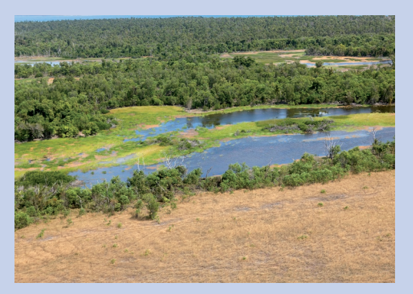
Cobourg Peninsula, Australia