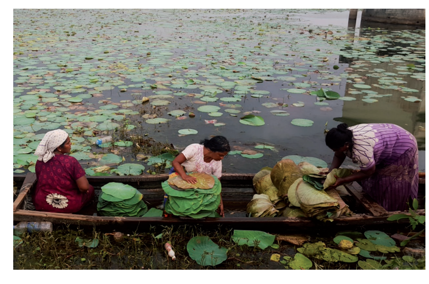
Women in India collecting leaves and flowers of lotus to sell. Wetlands are essential for the sustainable livelihood of millions of people around the world.

To assist the Parties in implementing the wise use concept, the Wise Use Working Group established at Regina developed Guidelines for the implement ation of the wise use concept , which were adopted by the 4<sup>th</sup> Conference of the Parties in Montreux, Switzerland, in 1990.