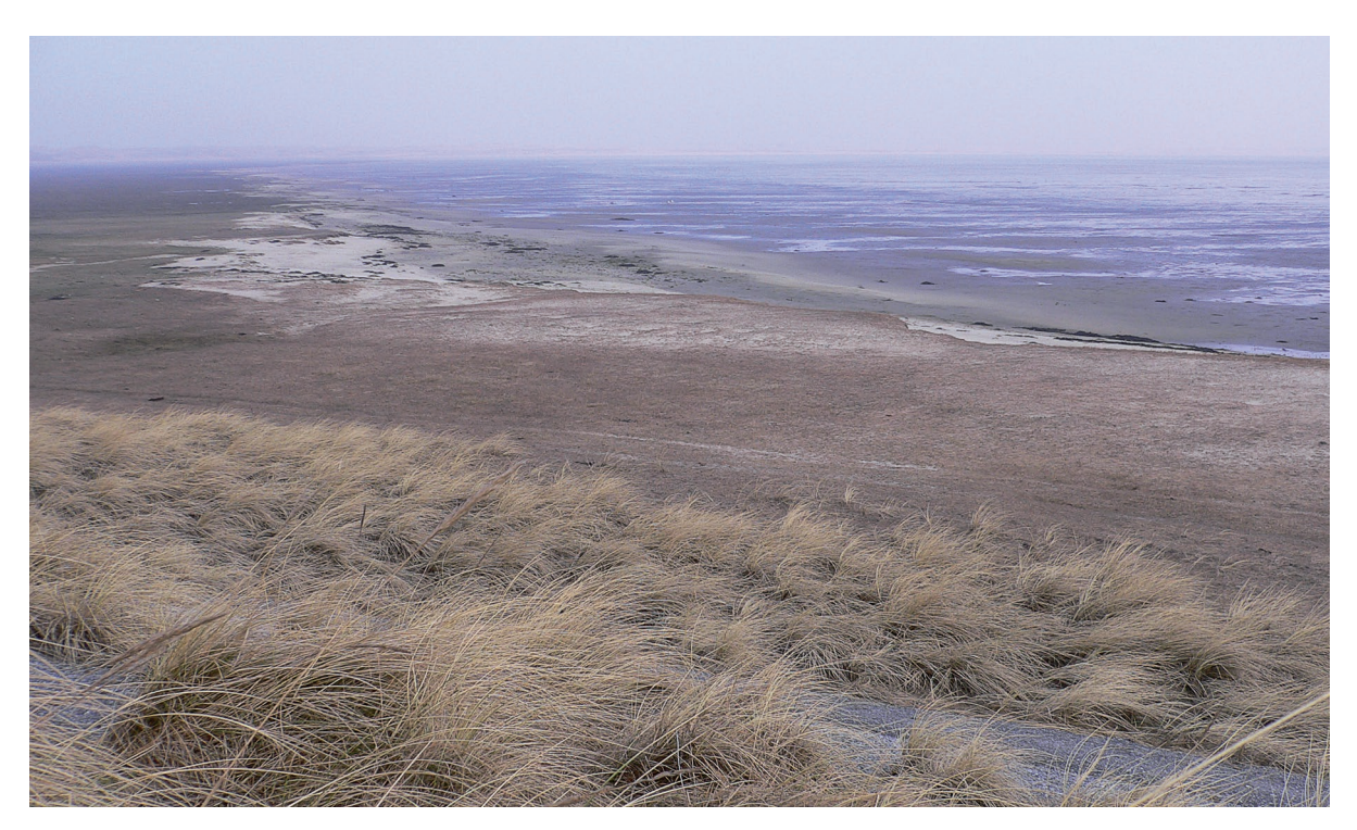
Wadden Sea is a Transboundary Ramsar Site covering 13 Ramsar Sites in Denmark, Germany and the Netherlands.