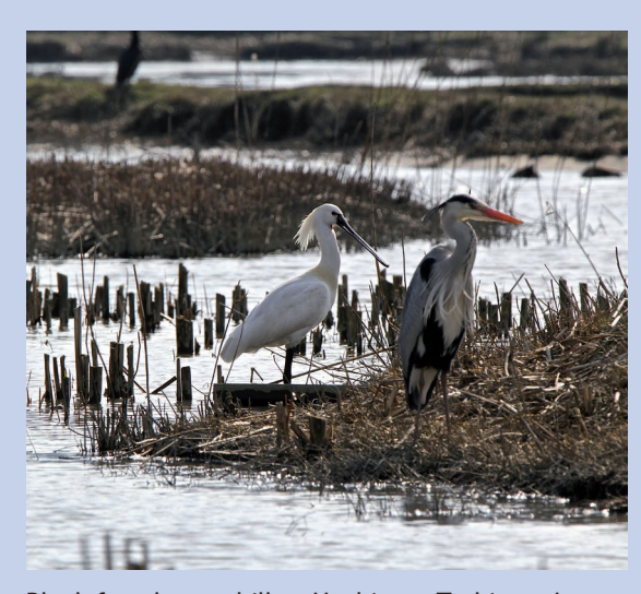
Black-faced spoonbill at Hachigoro Toshima, Japan

Criterion 1: A wetland should be considered internationally important if it contains a representative, rare, or unique example of a natural or near-natural wetland type found within the appropriate biogeographic region.