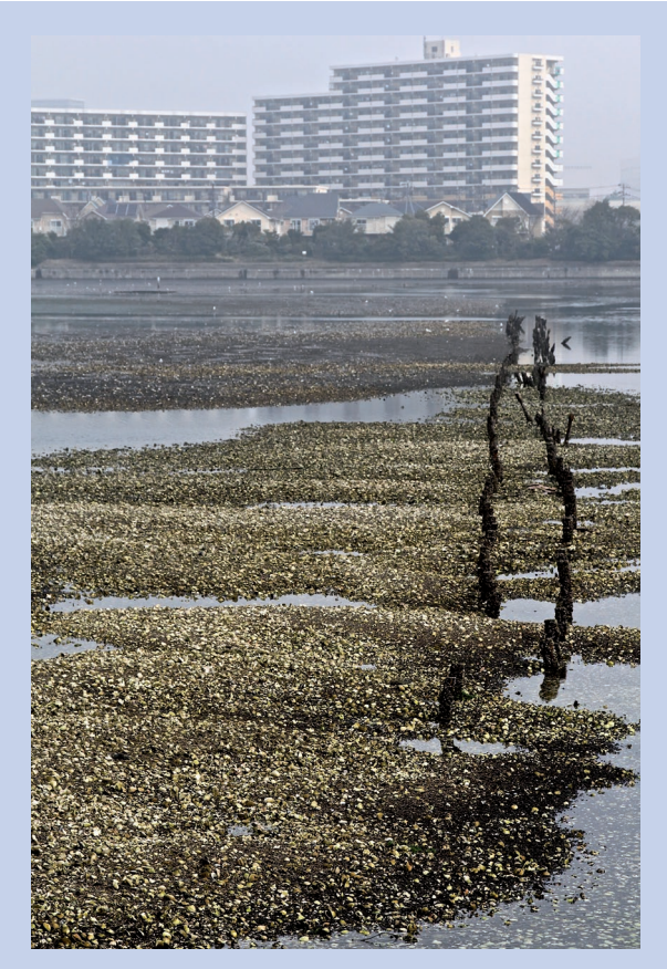
Yatsuhigata Tidal Flats, Tokyo Bay, Japan