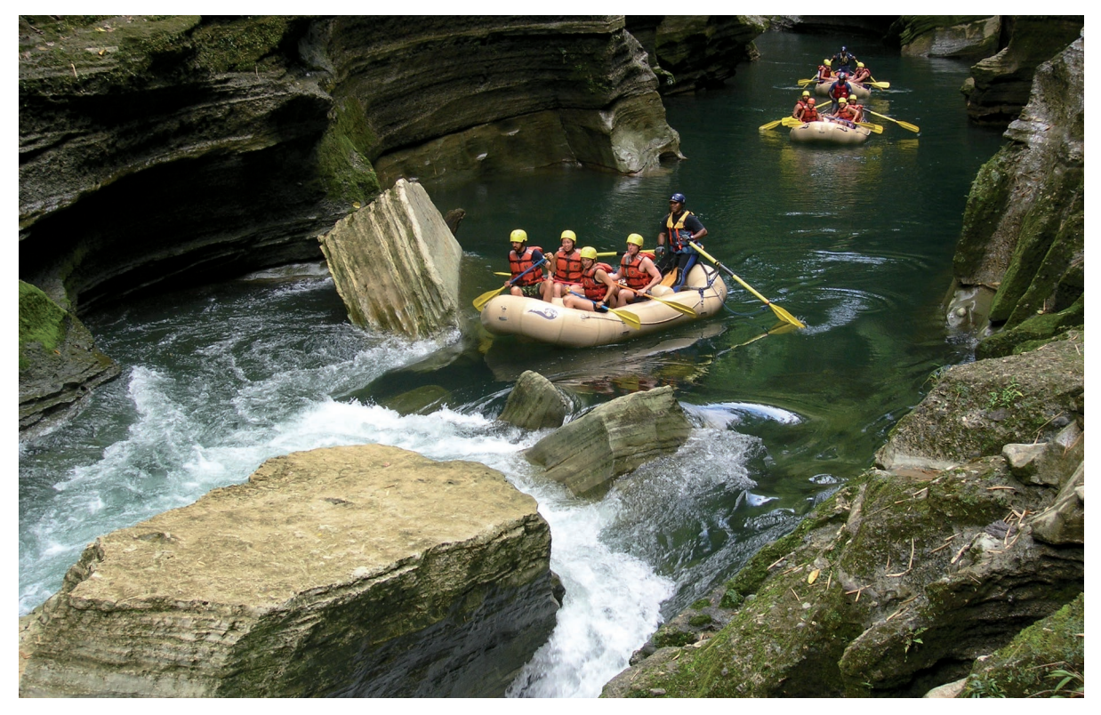
The Upper Navua Conservation Area Ramsar Site in Fiji. The Upper Navua River cuts a deep gorge in the central highlands of Viti Levu, the main island. The Site hosts important fauna and flora.

The core budget for the triennium 2016-2018 is Swiss francs 5,081,000 (ca. US$ 4.9 million or \\mathcal{C} 4.7 million at December 2015 exchange rates) per calendar year.