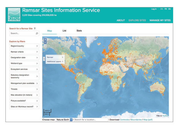
The Ramsar Sites Information Service (RSIS) at https://rsis.ramsar.org presents information on more than 2,200 Ramsar Sites.

provide essential data to everyone conducting research on one or many wetlands or developing global or national inventories of wetlands.