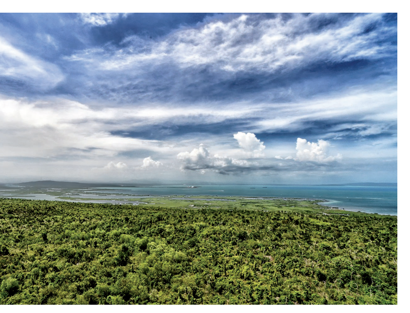
Portland Bight Wetlands and Cays Ramsar Site in Jamaica.

change in wetland ecological character (Resolution X.16, 2008; both in Handbook 15) provide guidance for designing site-based, provincial, national or regional wetland inventories.