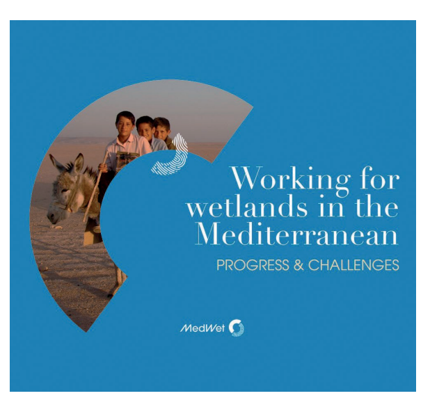
The Mediterranean Wetlands Initiative (MedWet) brings together 26 Mediterranean and peri-Mediterranean Contracting Parties to the Convention.

Following on from the success of MedWet and the development of the CREHO Ramsar Center in Panama (§4.5.2 below), the Parties, meeting in Valencia in 2002, established Guidelines in Resolution VIII.30 and encouraged the proposal of additional initiatives for endorsement and possible financial support. Through Resolutions at each of the next four COPs - namely Resolutions IX.7 (2005), X.6 (2008), XI.5 (2011), and XII (2015) - the Parties formally endorsed a variety of regional cooperation platforms as "Ramsar Regional Initiatives". As of 2016 there are four Ramsar Regional Centres for training and capacity building: the Ramsar Regional Center for Training and Research on Wetlands in the Western Hemisphere (CREHO) in Panama; the Ramsar Regional Center for Training and Research on Wetlands in Western and Central