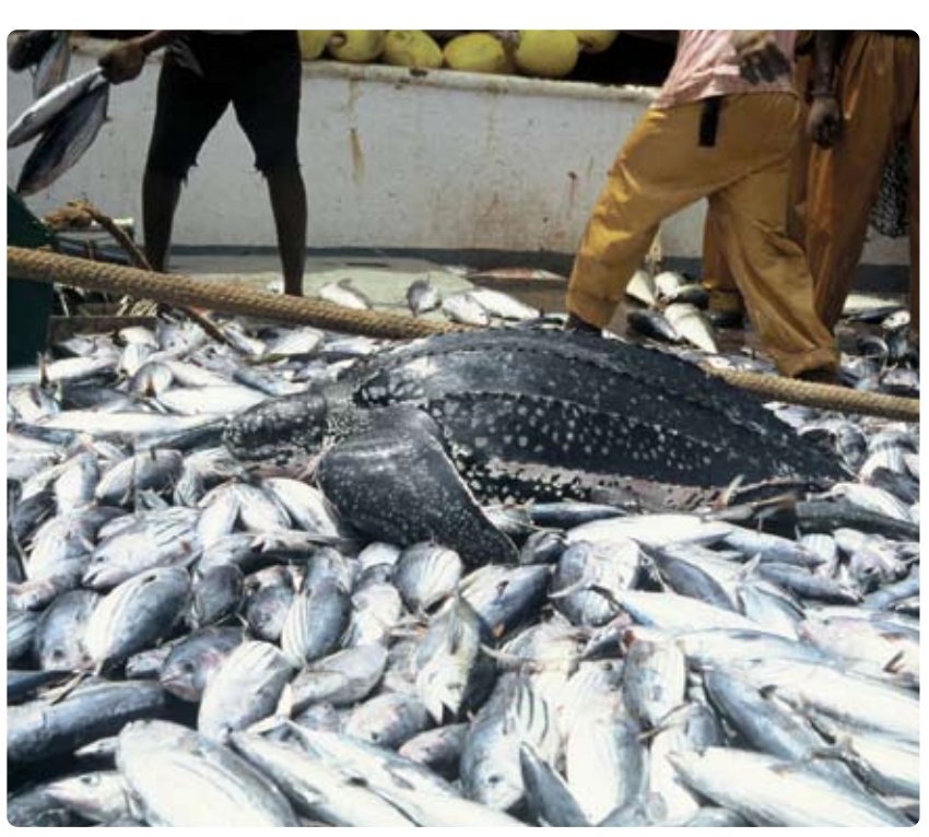
Leatherback turtle caught as bycatch, Atlantic Ocean.