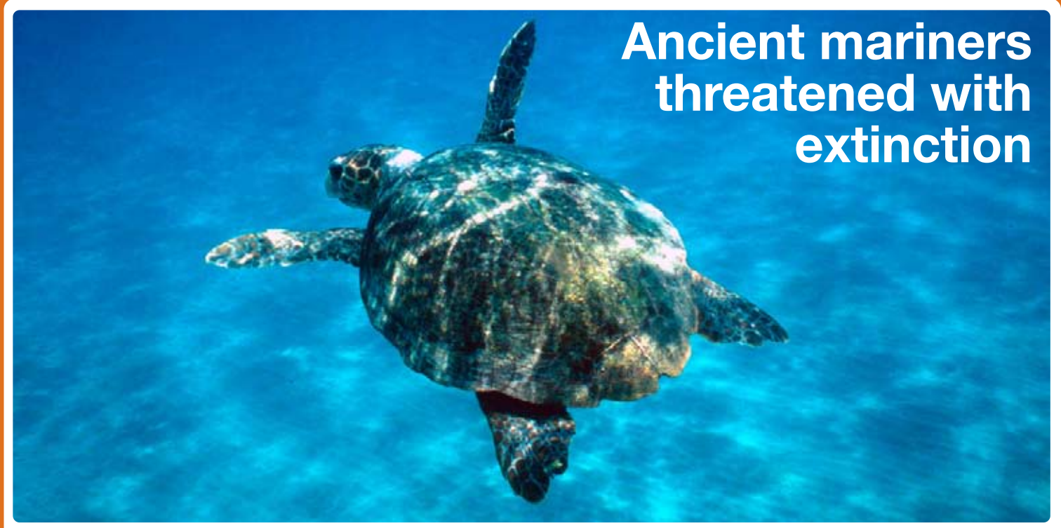
Loggerhead turtle swimming in open sea. Greece.

Marine turtles have swum in the world's oceans for over 100 million years. The only widely distributed marine reptiles, many species migrate for thousands of kilometres — and even across entire oceans - between feeding and nesting grounds. An integral part of coastal and marine ecosystems, they have also been fundamental to the culture of coastal societies for millennia. But human activities over the past 200 years have massively tipped the scales against the survival of these ancient mariners. Slaughtered in the millions for their eggs, meat, skin, and shells, their already reduced populations still suffer from poaching and over-exploitation, as well as incidental capture in fishing gear and habitat loss and alteration. Today, six of the seven living species are classified as Endangered or Critically Endangered. Concerted conservation efforts have seen turtle populations recover in some areas, but without urgent global action the future of these magnificent animals looks increasingly grim.