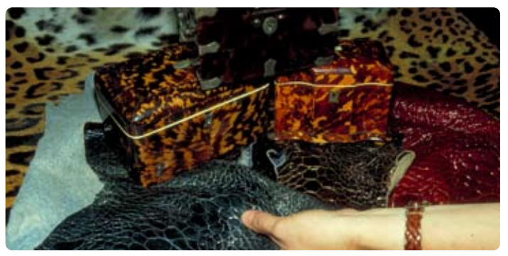
Illegal marine turtle skins and bekko (tortoiseshell) boxes seized at customs.