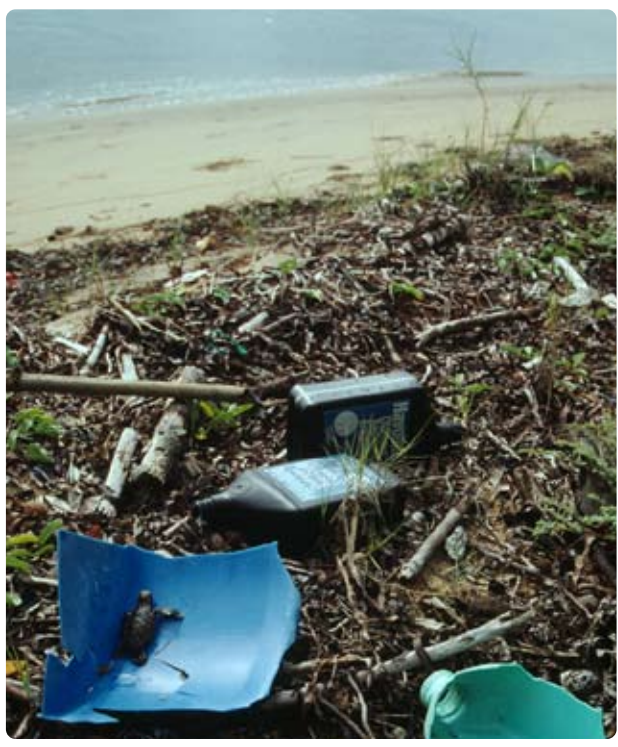
Newly hatched hawksbill turtle trapped in plastic rubbish, Manatee Lagoon Beach, Belize.

Uncontrolled coastal development, vehicle traffic on beaches, and other human activities have directly destroyed or disturbed marine turtle nesting beaches and near-shore feeding grounds around the world. Feeding grounds such as coral reefs and seagrass meadows are also being damaged and destroyed by sedimentation due to land clearing, nutrient run-off from agriculture, insensitive tourist development, and destructive fishing techniques. In addition, turtles can mistake floating plastic garbage for jellyfish and choke to death when they try to eat them.