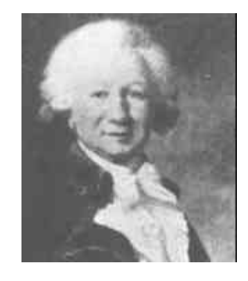
Louis Antoine de Bougainville -French aristocrat who navigated east coast of new Guinea and islands region in 1768-69