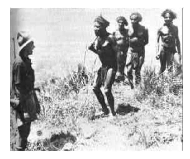
Michael Leahy making contact with the people of the upper Purari River during the 1930 expedition across New Guinea from Salamaua to Port Romilly at the mouth of the Purari River.

Watch the video 'First Contact' and describe the aspects of the contact you find most interesting, upsetting