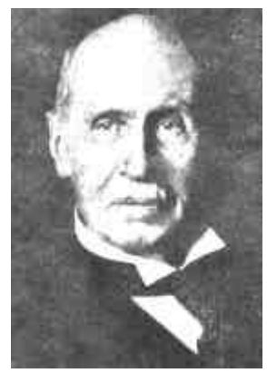
Sir Hubert Murray, lieutenant governor of Papua, 1908 to 1940. He formulated a policy of protection for the Papuan people, controlled European economic activity and careful application of law and administration