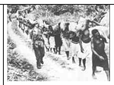
Carriers under the control of members of the Australian New Guinea Administrative Unit (ANGAU) taking supplies to a forward area in 1942.