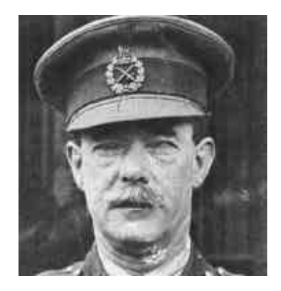
Brigadier General E Wisdom who was appointed administrator of the civil government of the Mandated Territory of New Guinea in 1921