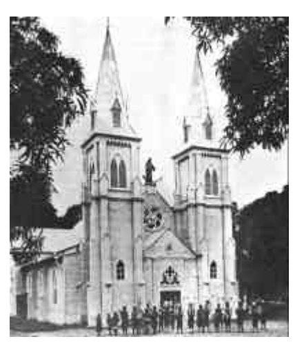
Plate 293 The cathedral of the Sacred Heart at Vunapope, the headquarters of the Sacred Heart mission in New Britain, about 1932. This cathedral was destroyed by Allied bombing in 1943.