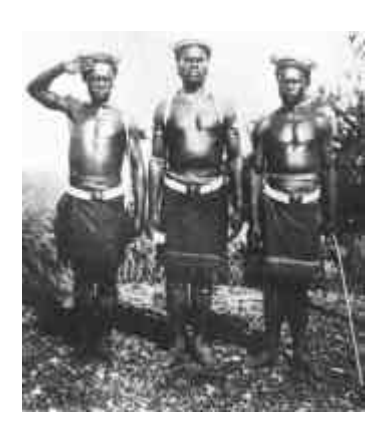
Papuan police at Buna in 1920